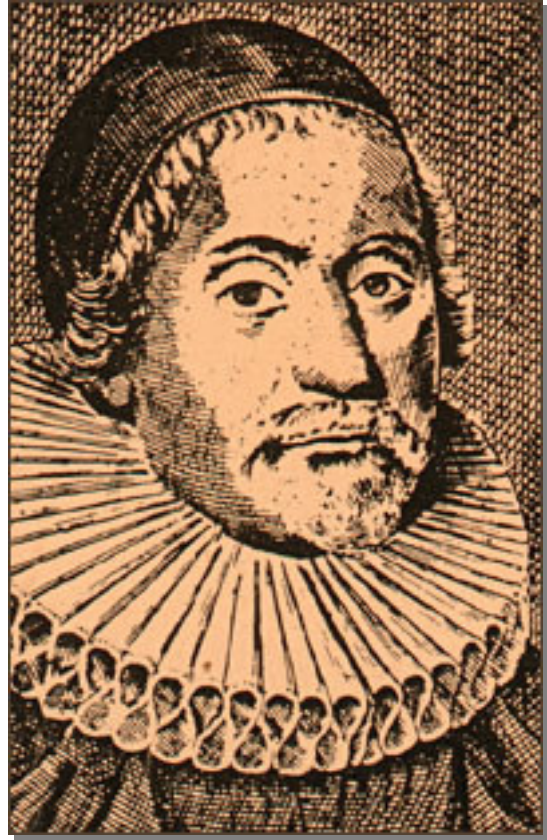
Archbishop James Ussher of Armaugh

As I mentioned before, James Anderson has been credited with the calculation of the “Year of Light”. However, it is entirely possible that, sometime between 1650 and 1654, someone else already did the math. Irish Archbishop and theologian, James Ussher of Armaugh, attempted to examine the text within the book of Genesis and other unspecified historical documents in order to calculate how many years before the birth of Christ was the mystical Creation of the Universe. So certain of his results, Archbishop Ussher went so far as pinpointing the exact date of Creation as being at sunset on October 22 nd , 4004 BC – calling it Anno Mundi – The Year of the World . This calculation had since been introduced as a footnote within copies of the King James Bible in 1701 AD and, from that time forward, has become the cornerstone epoch of the Christian Creationism philosophy 3 . Twenty years later, enter James Anderson, who claimed that the chronological marker “A.:L.:” was calculated by adding an even 4000 to the current year, rather than 4004, a discrepancy that cannot be attributed to the English conversion from the Julian to the Gregorian calendar which didn’t occur until 1752. Thus began the curious paradoxical question, was Jesus Christ born in 4 BC 4 ?